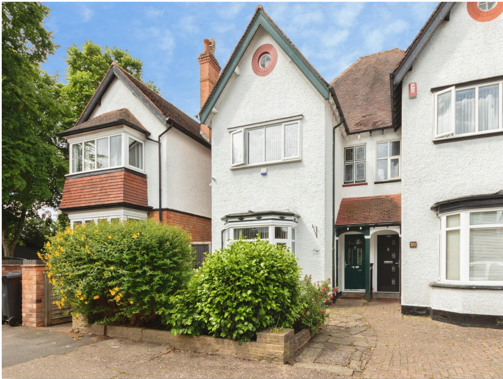
Southam Road, Hall Green Birmingham B28 8DG