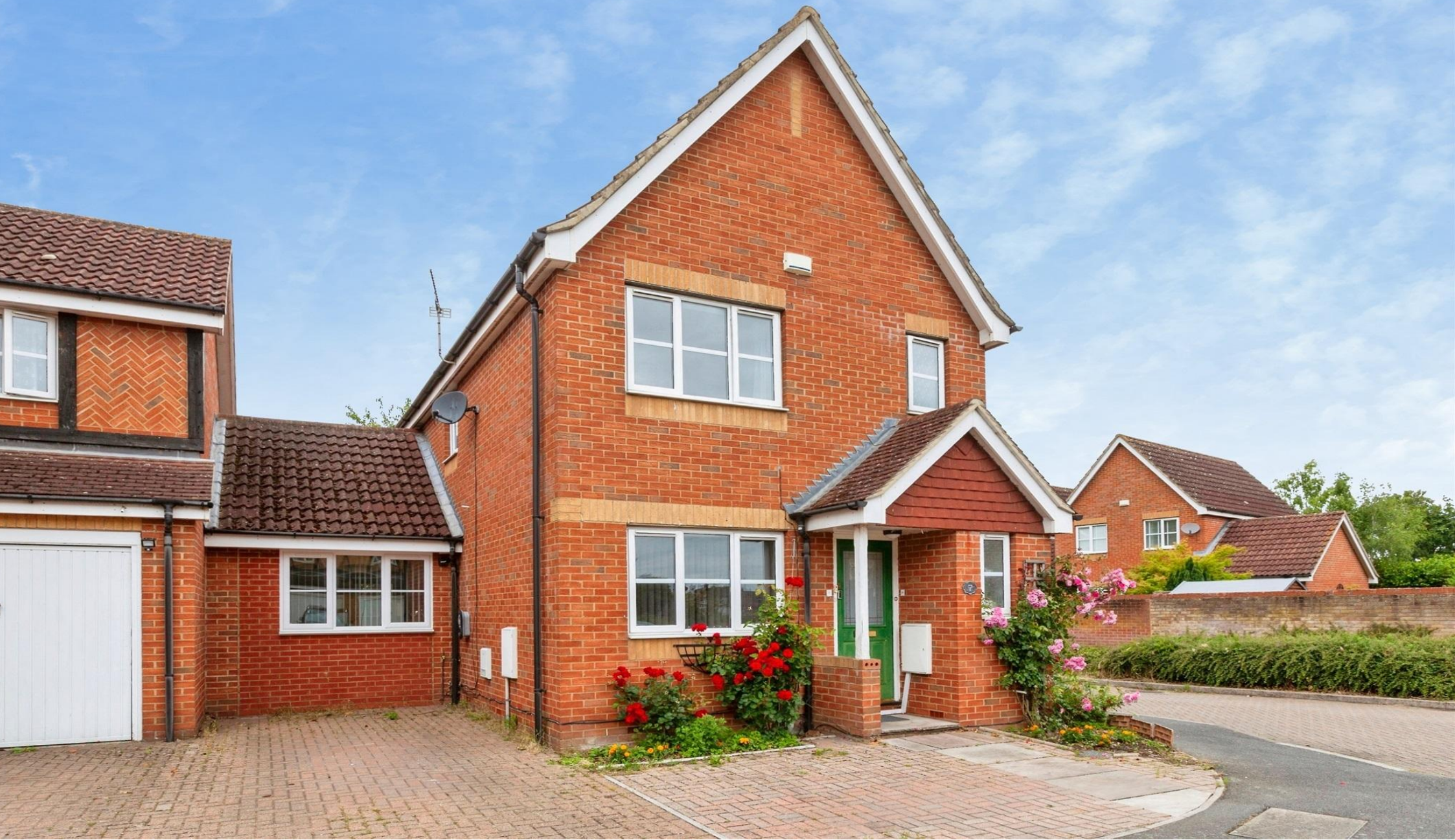
Ferrers Close, Slough SL1 5TS