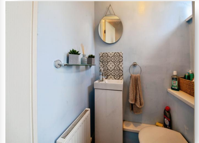
St. Marys View, Munsbrough Rotherham S61 4NJ