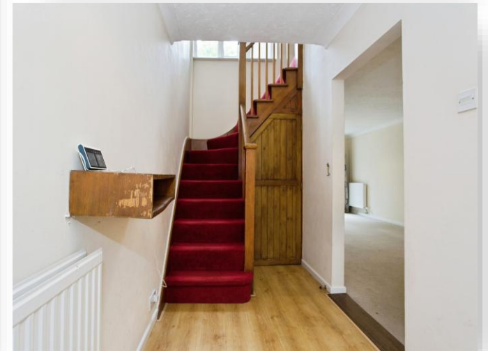
Cottenham Road, Histon Cambridge CB24 9ET