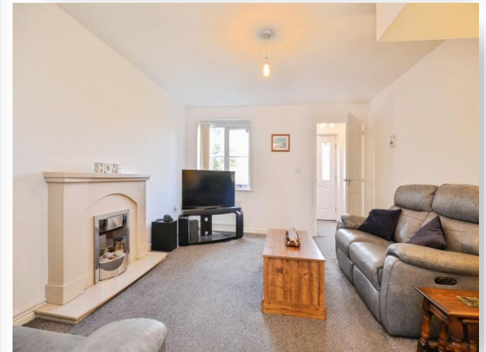
Bancroft Drive, Ingleby Barwick Stockton-On-Tees TS17 5NP