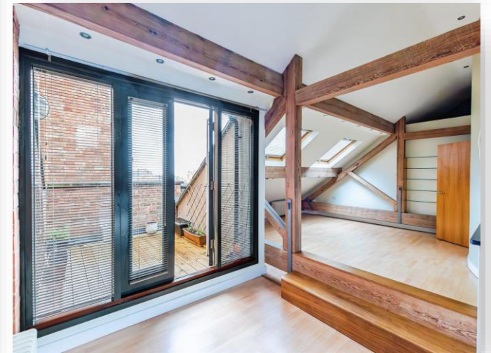
Grove Works, Clare Street, Northampton NN1 3LS