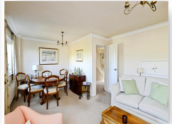
Derwent Close, Waterlooille PO8 0DH