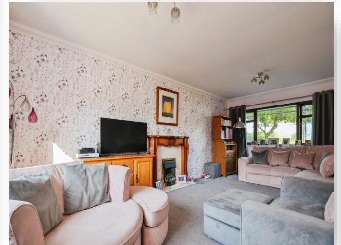
Rosewood Court, Marton-In-Cleveland Middlesbrough TS7 8QR