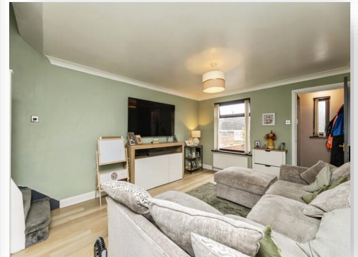
Worcester Avenue, LEEDS LS10 4SA