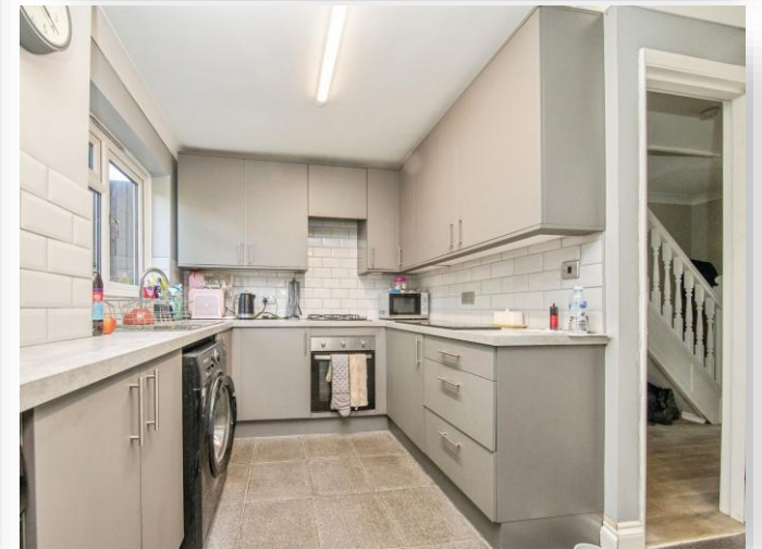
Weaver Close, Ipswich, IP1 5RB