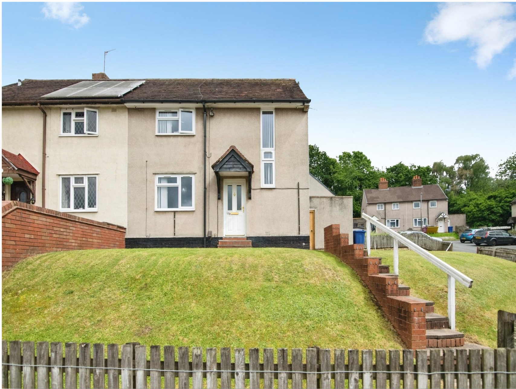
Lodge Crescent, Netherton DUDLEY DY2 0HQ