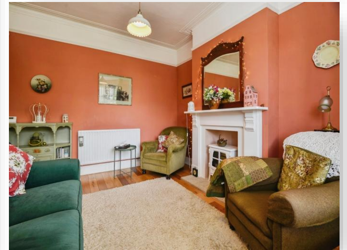
Grays Road, Stockton-On-Tees TS18 4LP