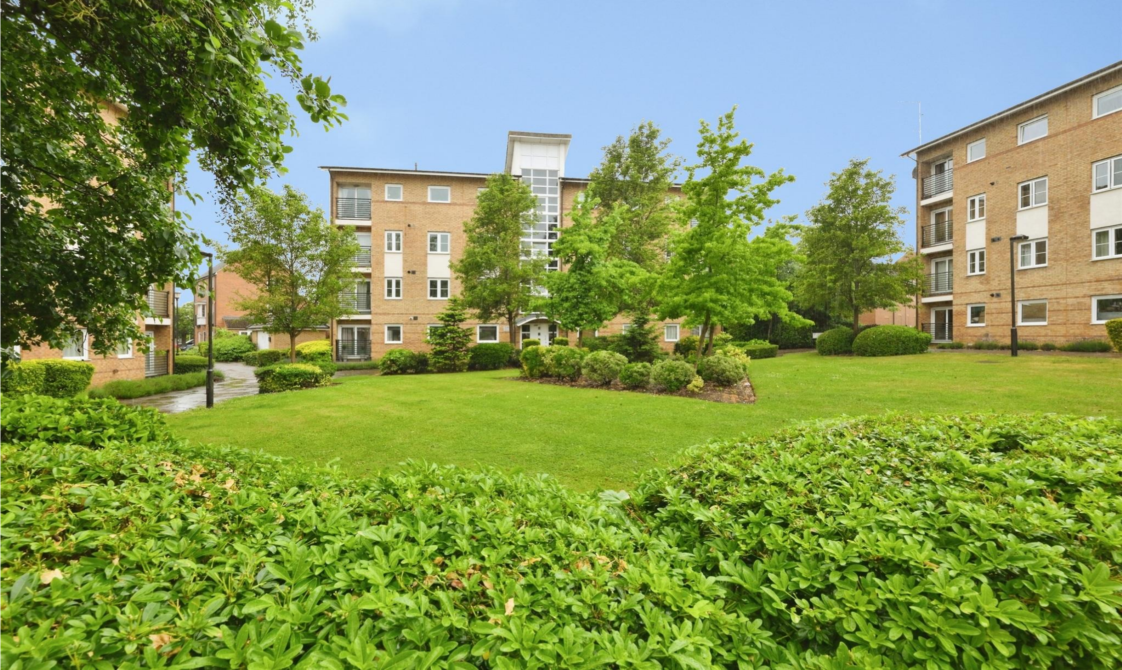
St. Josephs Green, Welwyn Garden City AL7 4TT