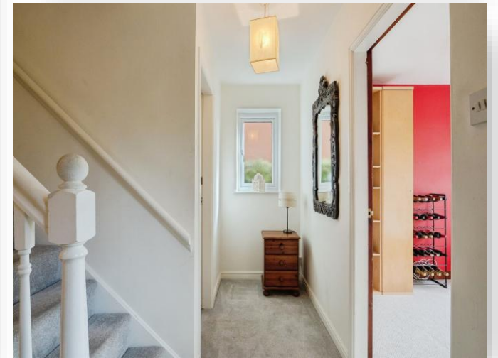
Forest Road, LOUGHBOROUGH