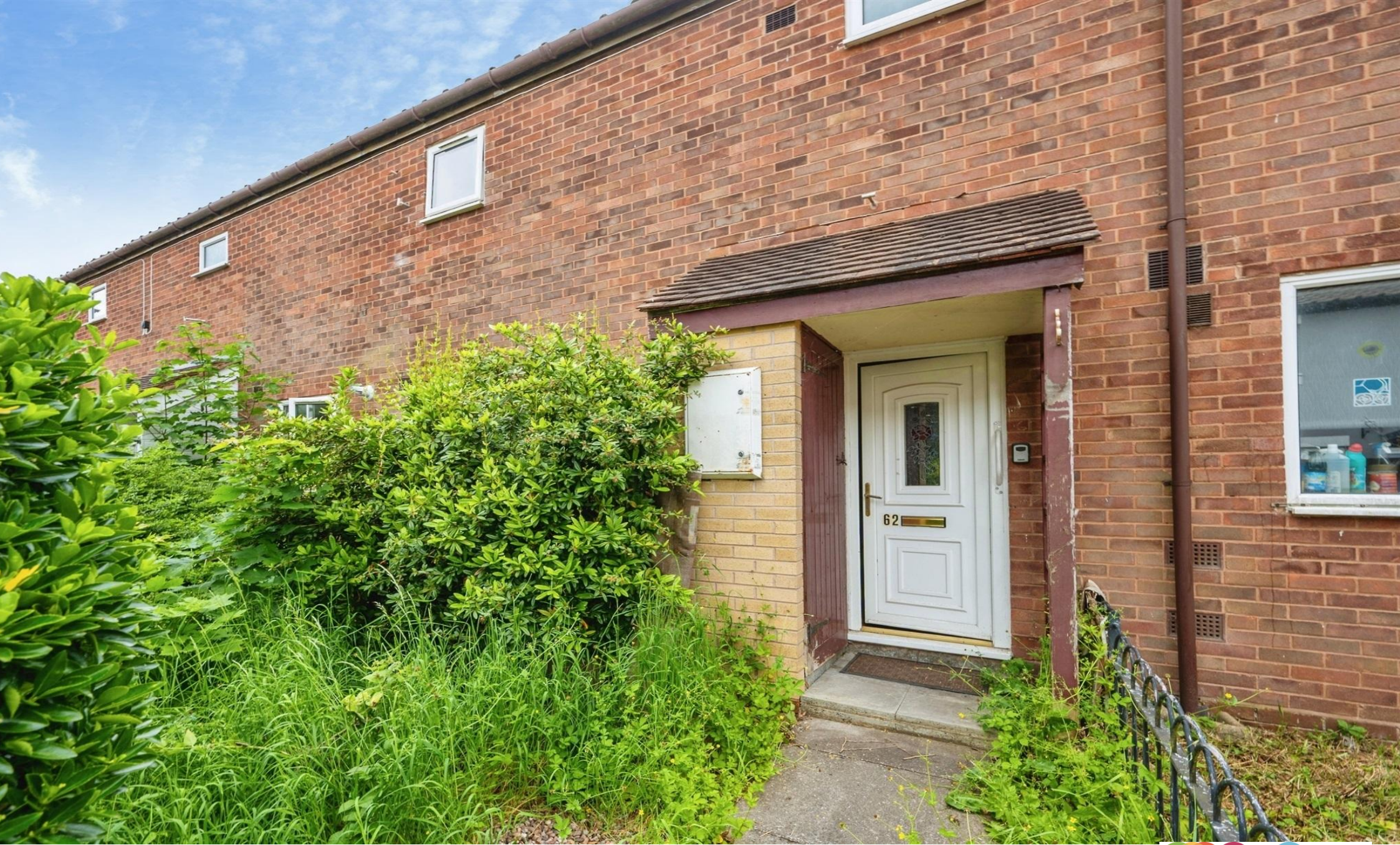
Doverdale Close, Redditch B98 7SB