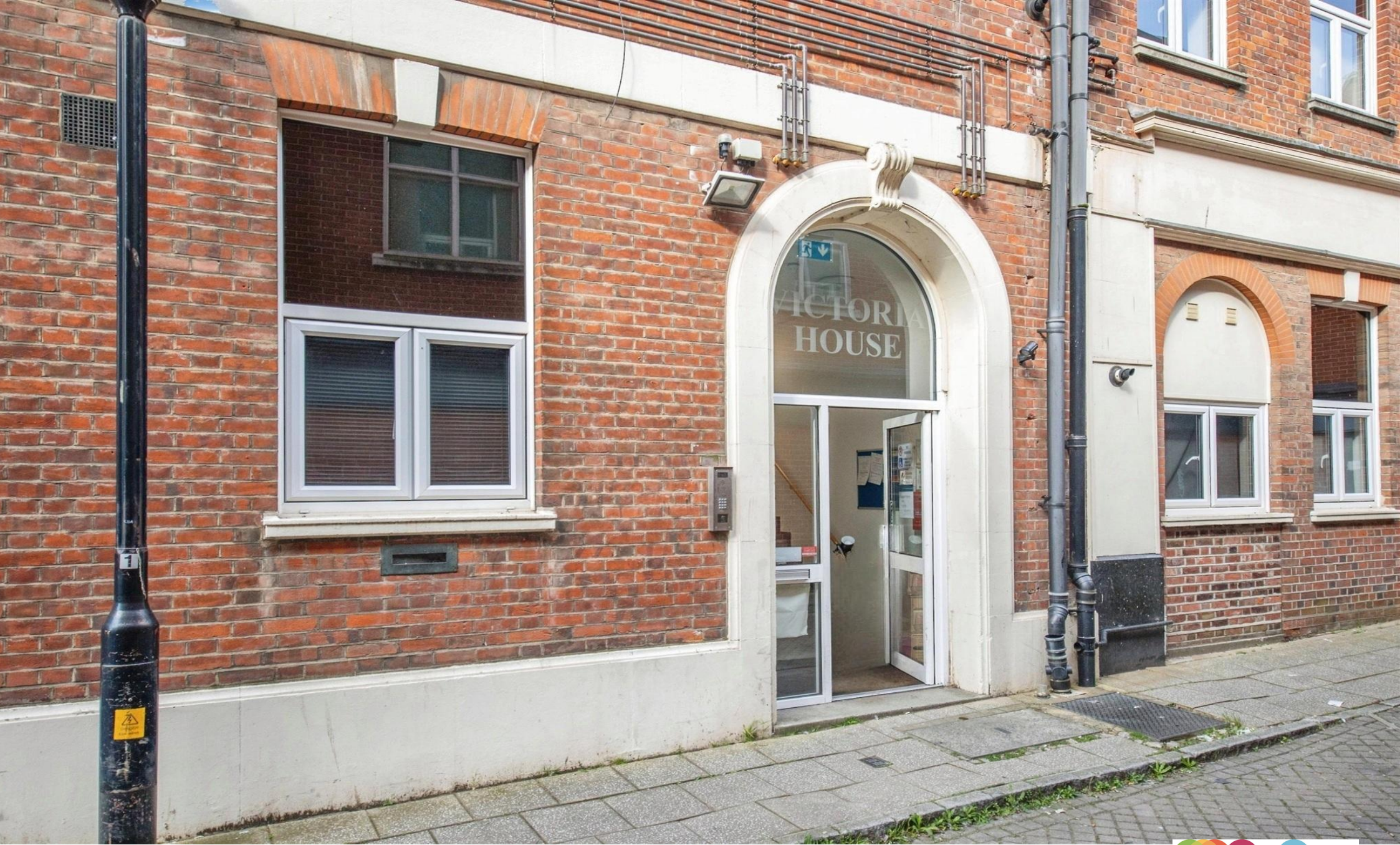
Victoria House, Eld Lane, Colchester, CO1 1PE