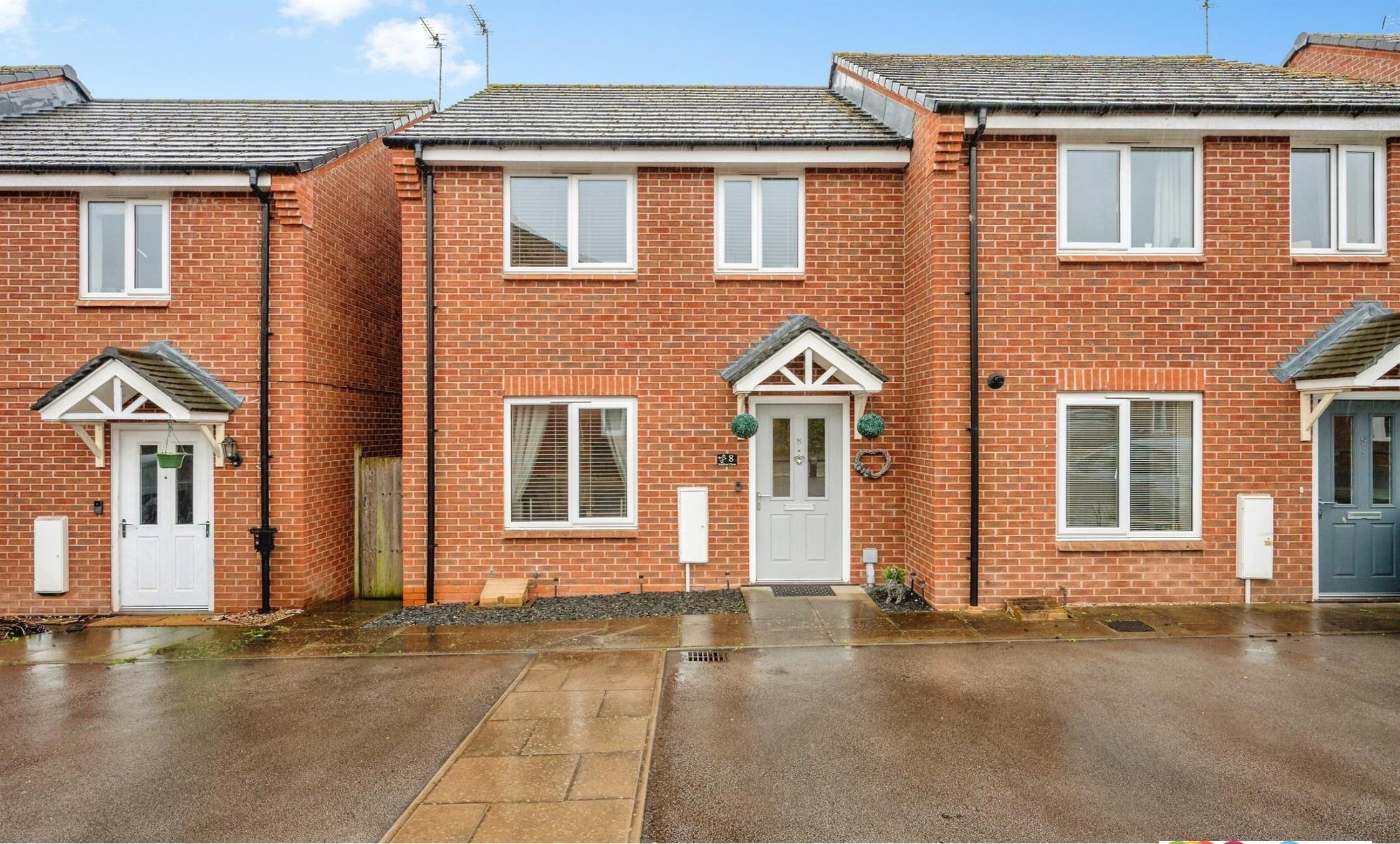
Hadlow Close, Greenlands Redditch B98 7FU