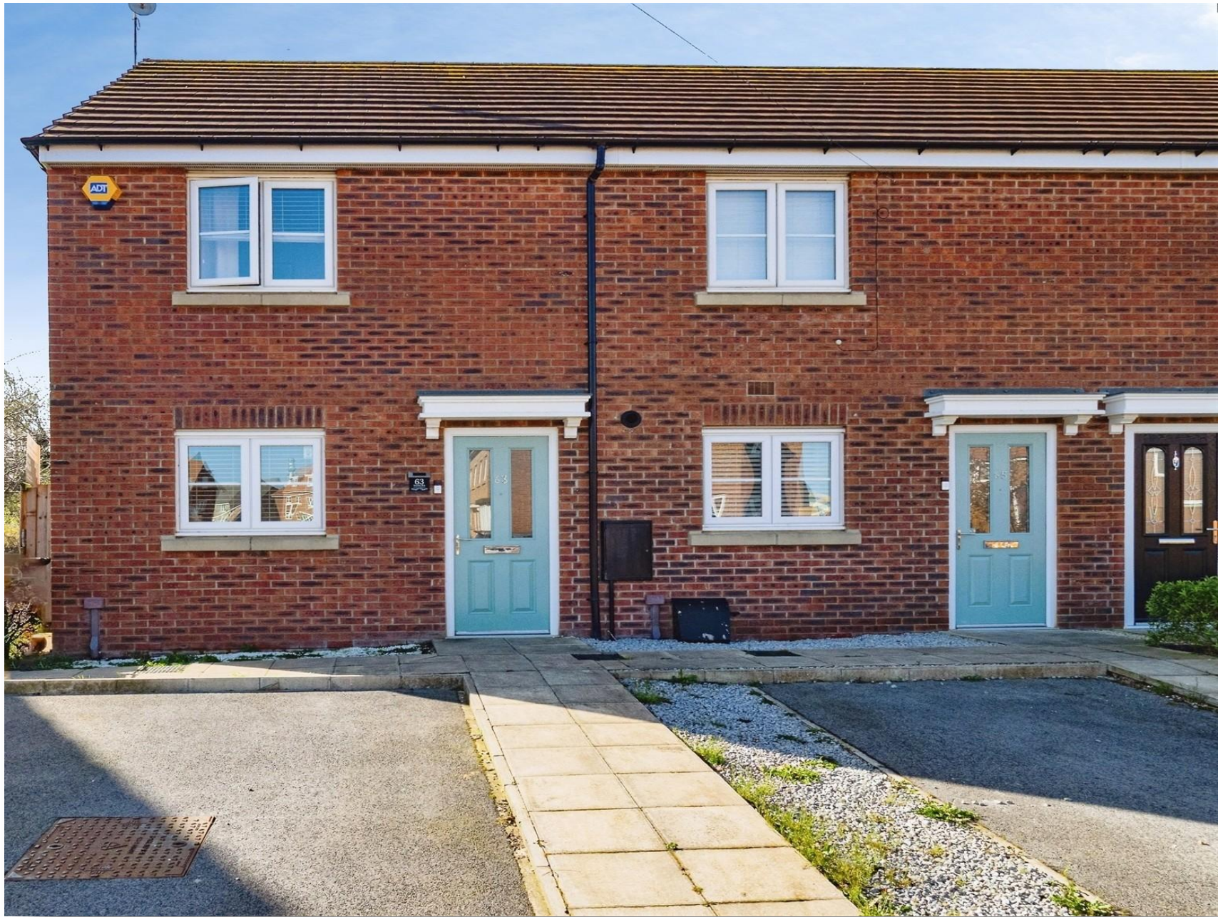
Waudby Way, Hull, HU9 4DG