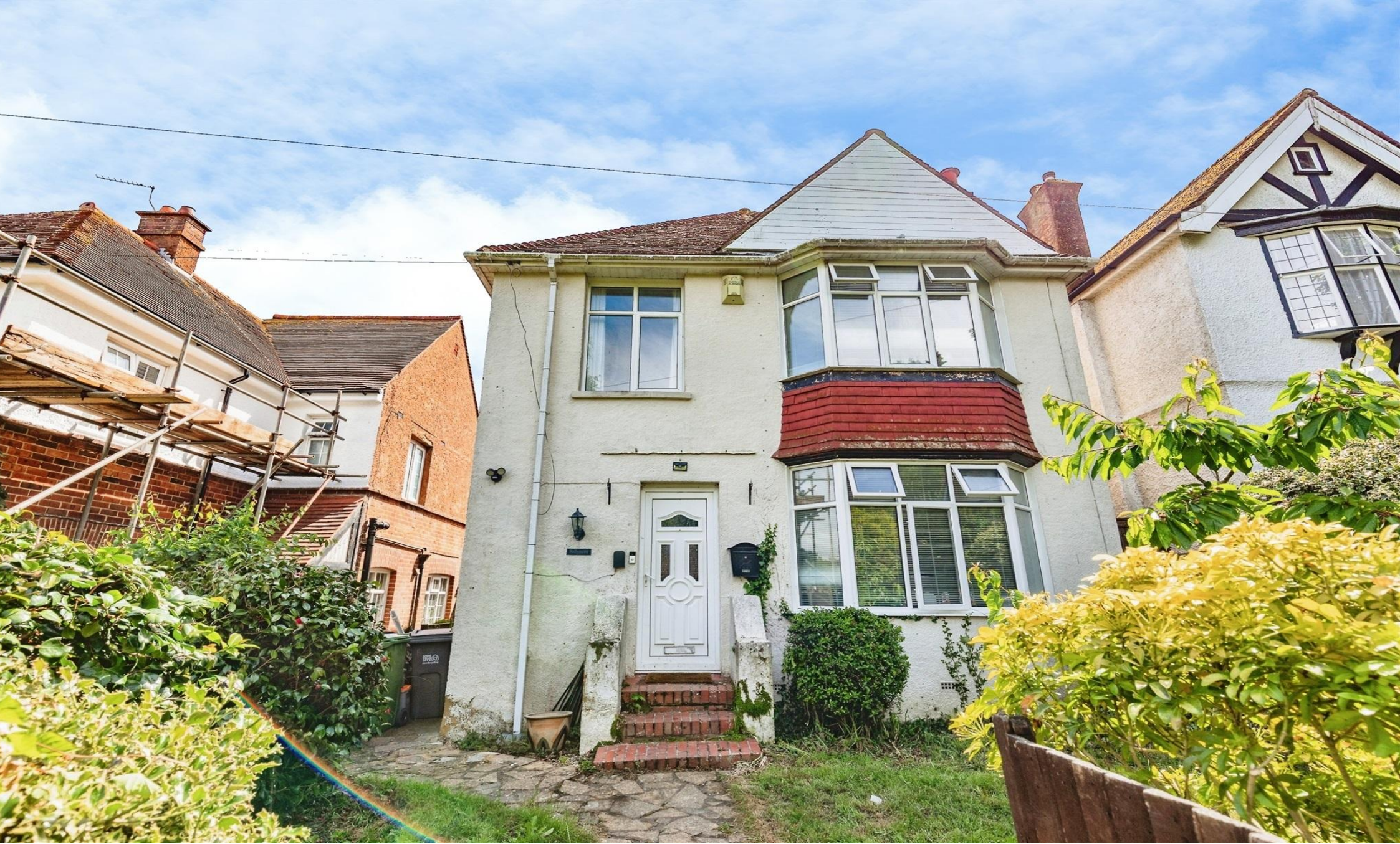
Ballymore - Holliers Hill, Bexhill-On-Sea TN40 2DU