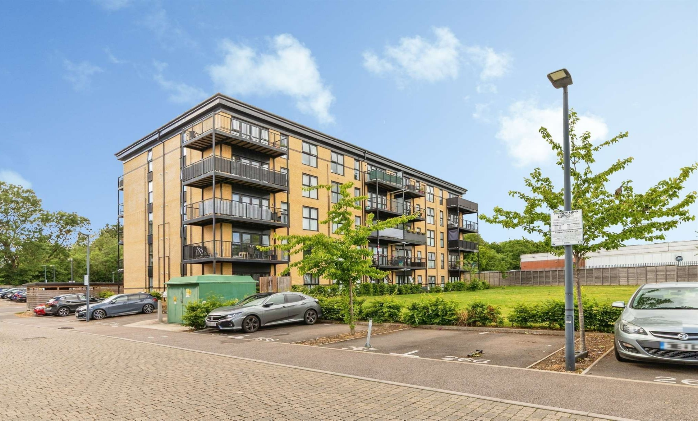
Shapiro House Giles Crescent, Stevenage SG1 4GW