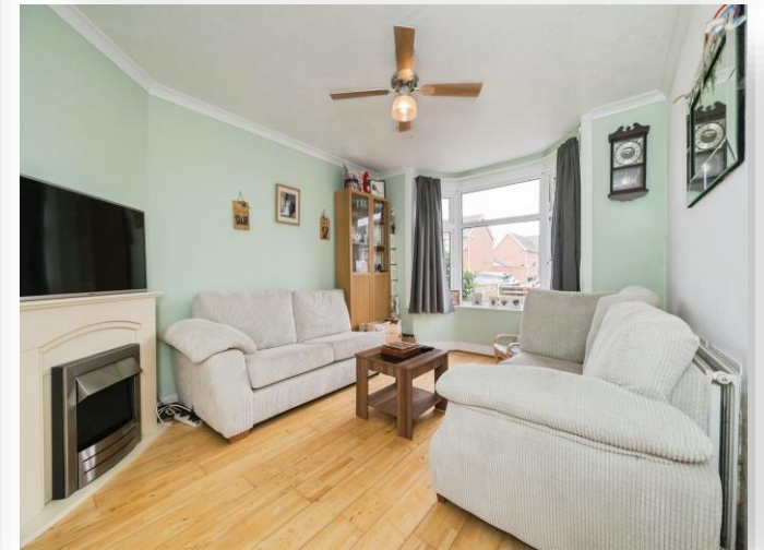
Arnold Road, Eastleigh. SO50 5AS