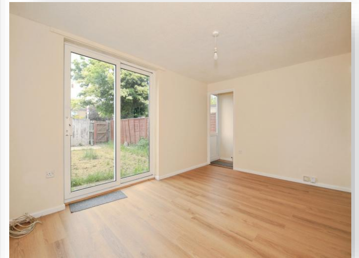
Drayton, Bretton PETERBOROUGH PE3 9XL