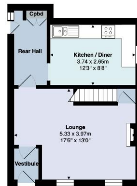
Ground Floor Approx. Floor Area: 37.0 m 2 ... 398 ft 2