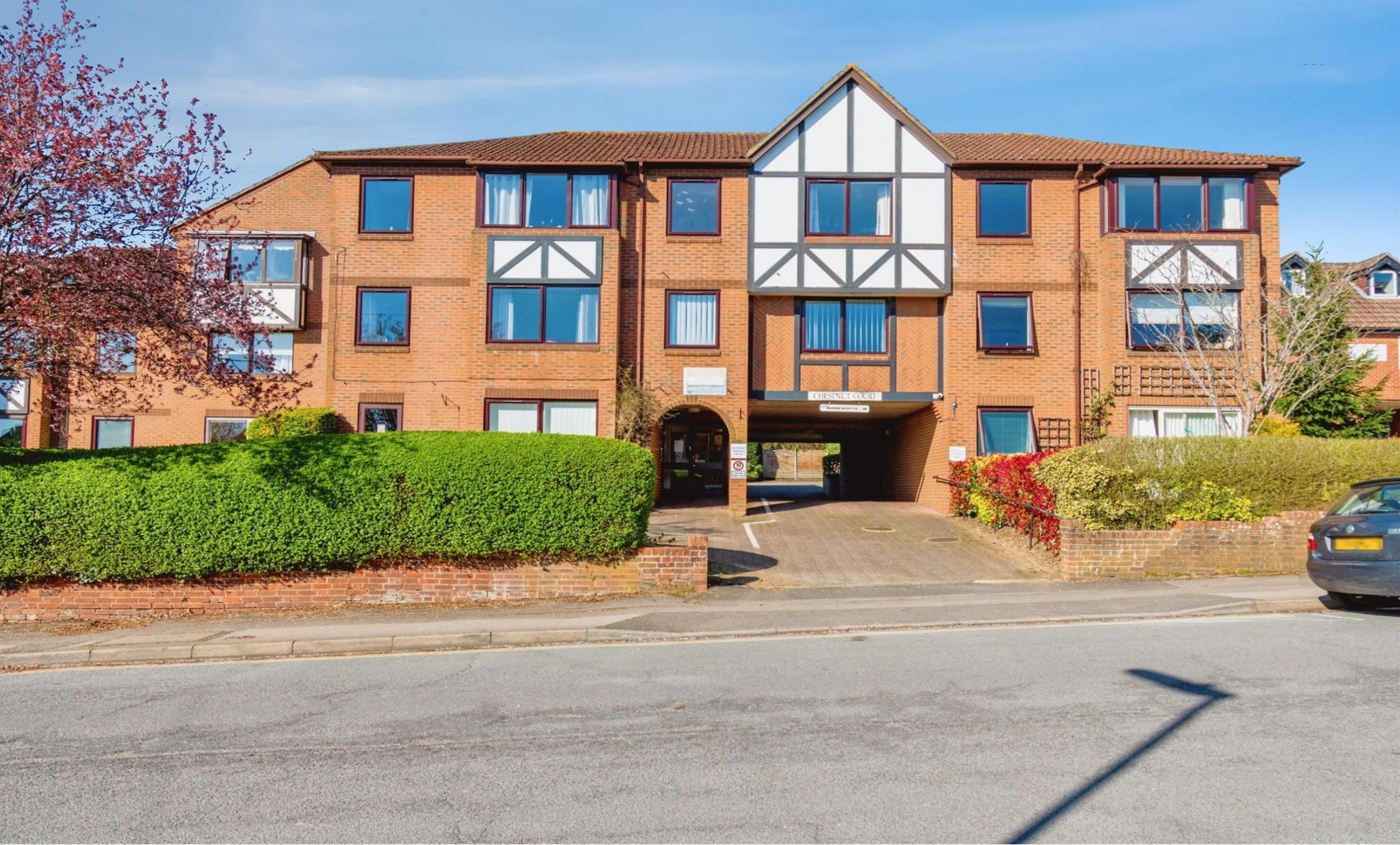
Chestnut Court, Shaftesbury Avenue, Southampton SO17 1SE