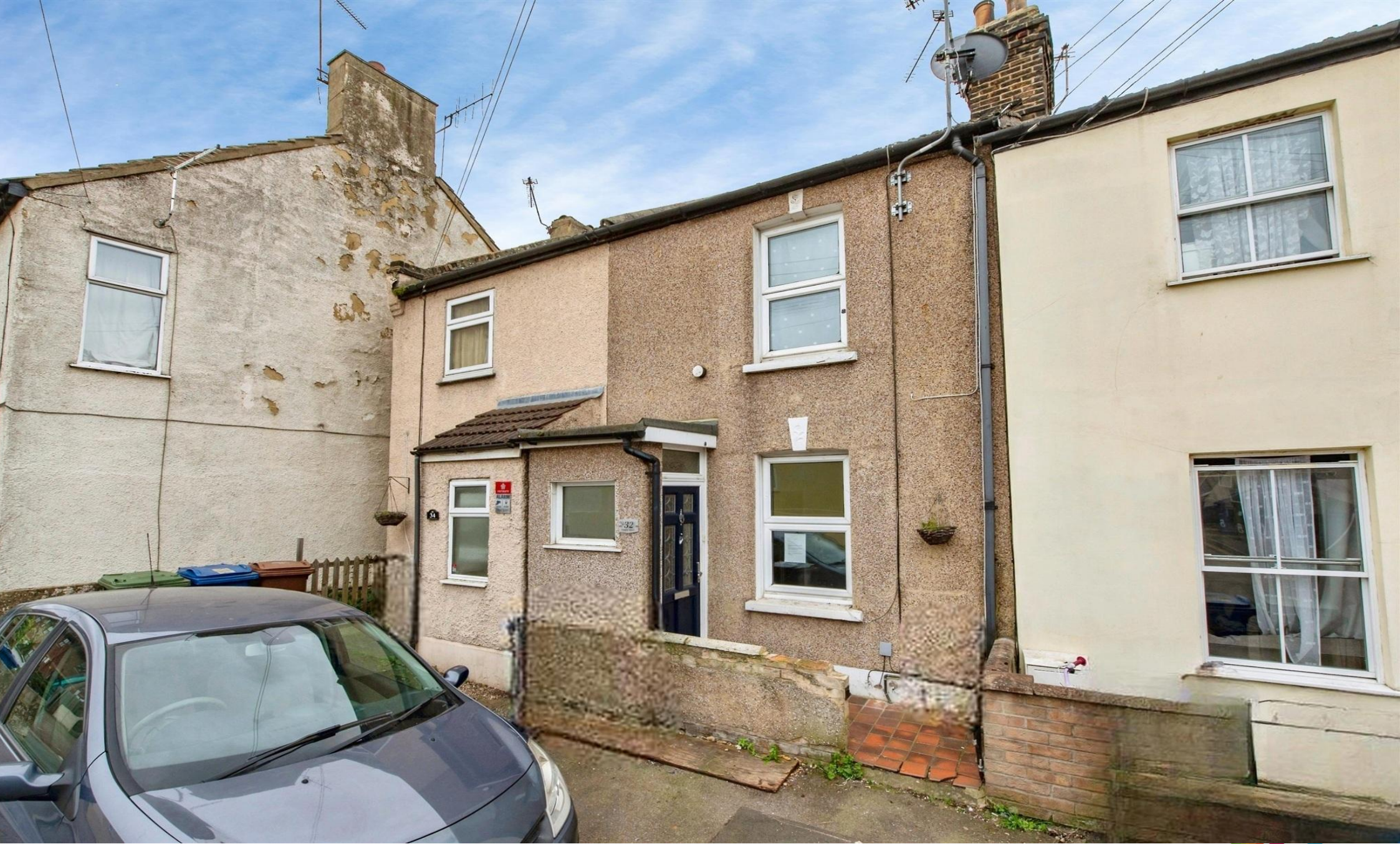
Church Street, Grays RM17 6EG