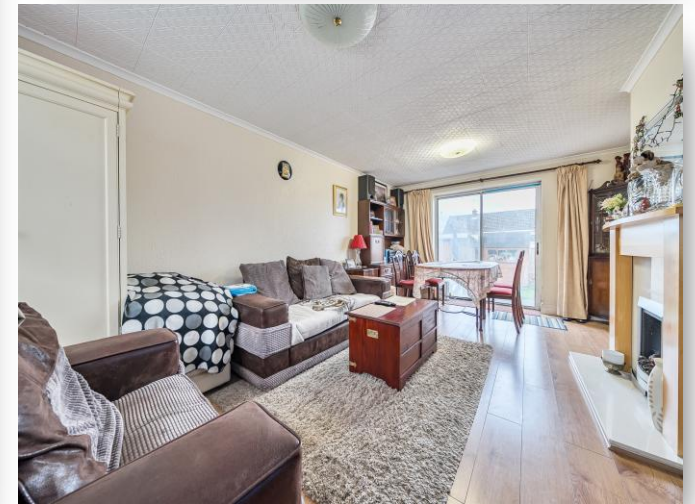
26 Gloucester Road, Maidenhead SL6 7SN