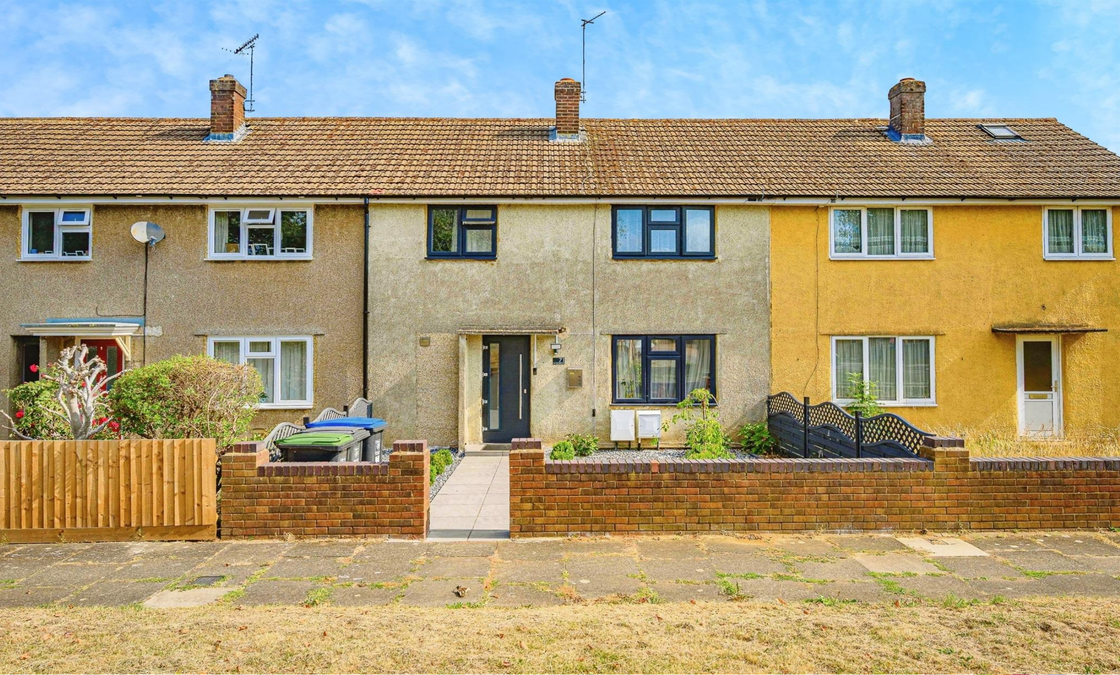
Brickmakers Lane,HEMEL HEMPSTEAD HP3 8PA