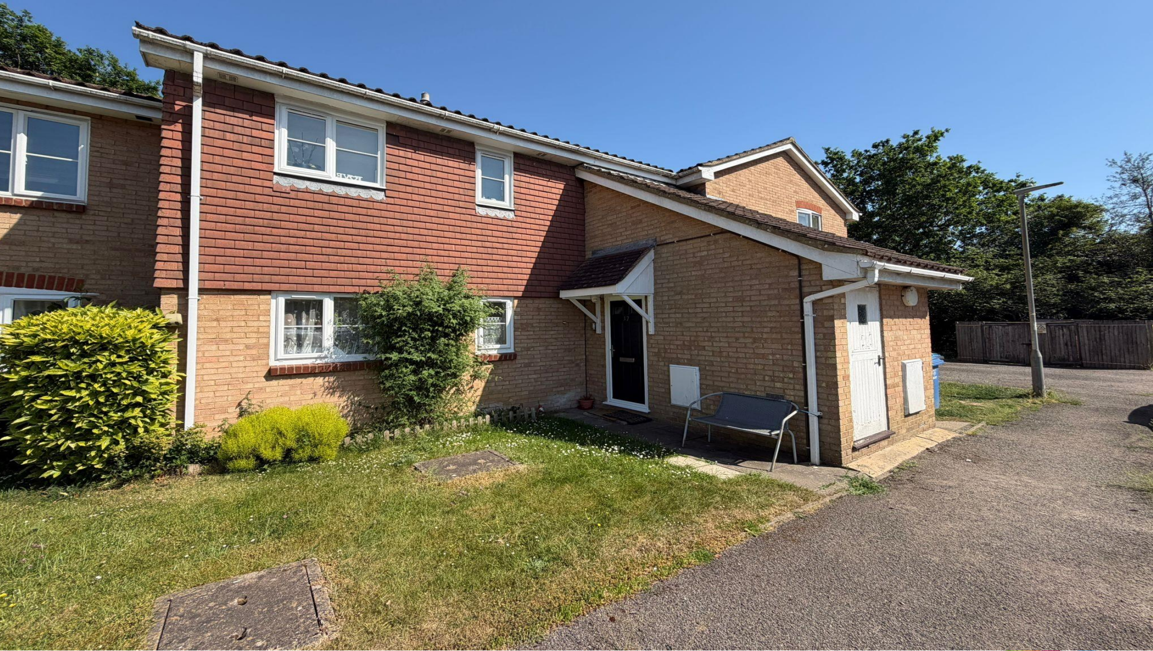
Hales Park Close, Hemel Hempstead HP2 4TJ