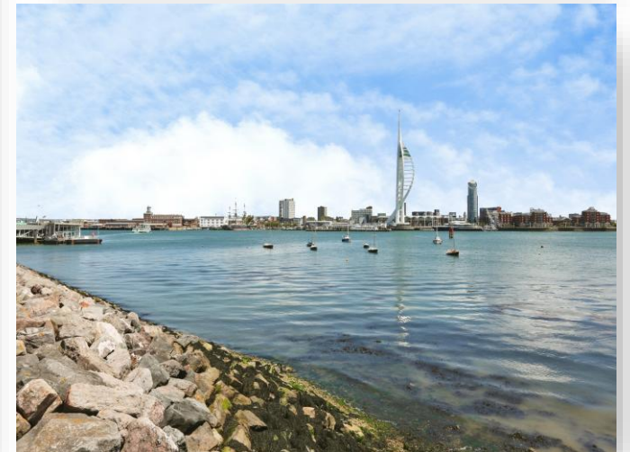
Harbour Tower, Trinity Green, Gosport, PO12 1HF