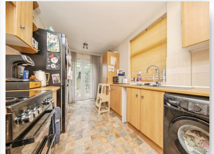
Westbourne Road, Ipswich, IP1 5EW