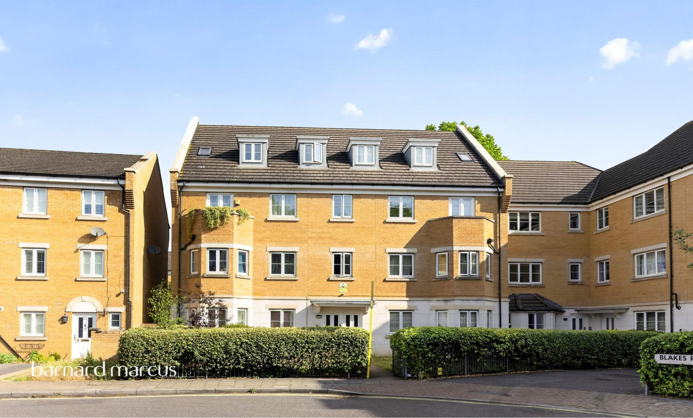
Blakes Road, London SE15 6HF