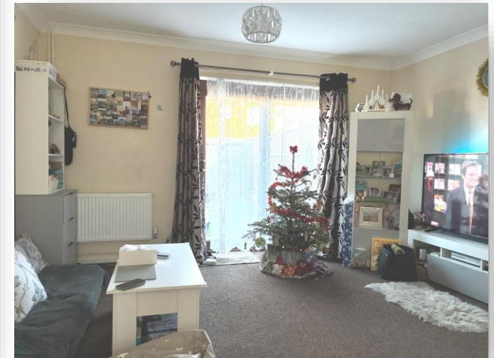
Harrys Way, Wisbech, PE13 2TX