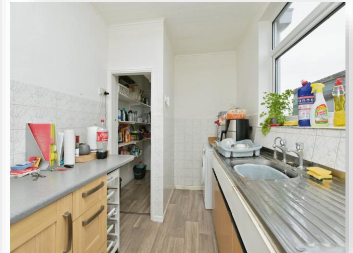
Crowland Road, Eye Peterborough PE6 7TP