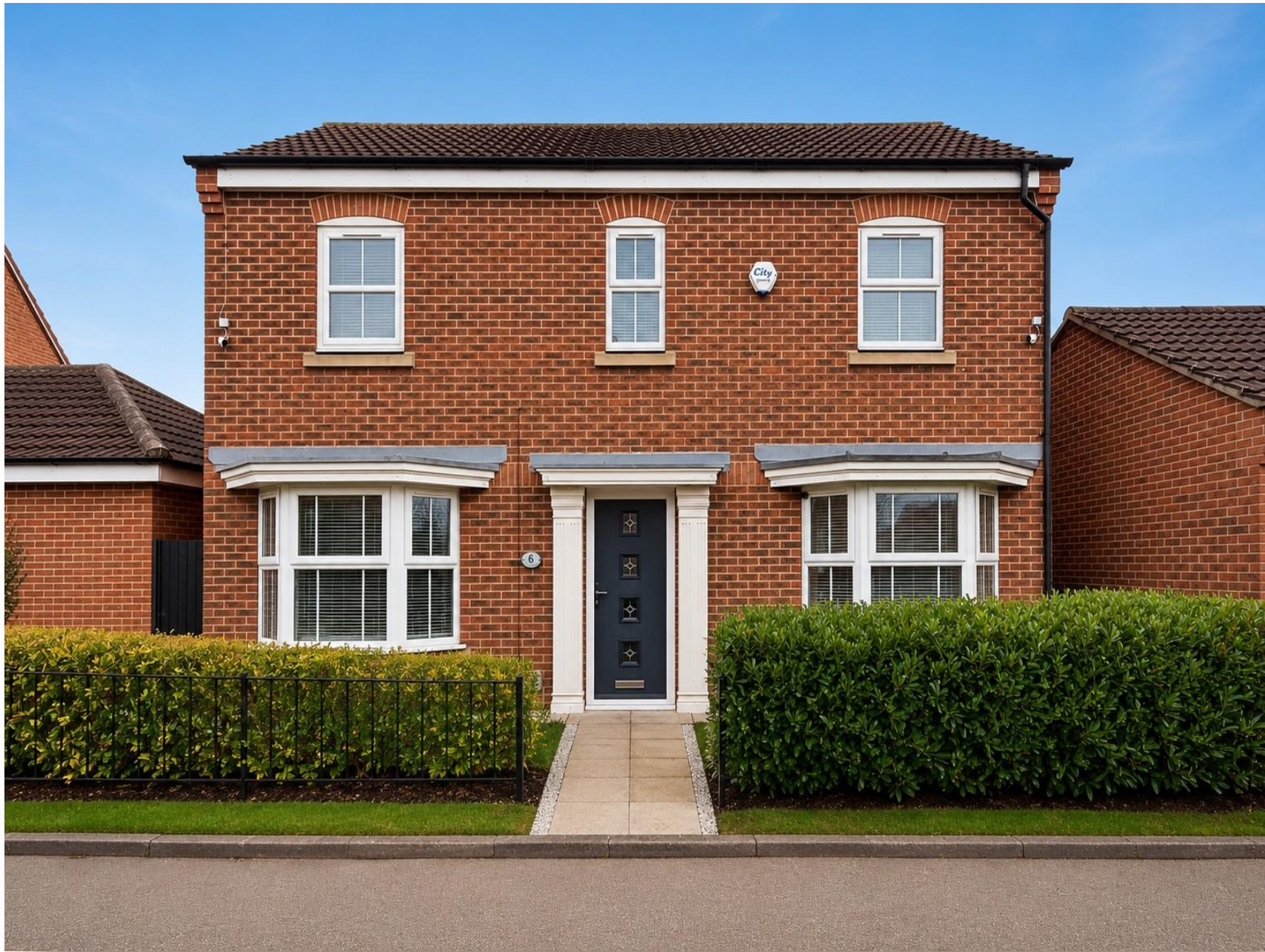
Loseley Park, Kingswood, Hull, HU7 3GJ