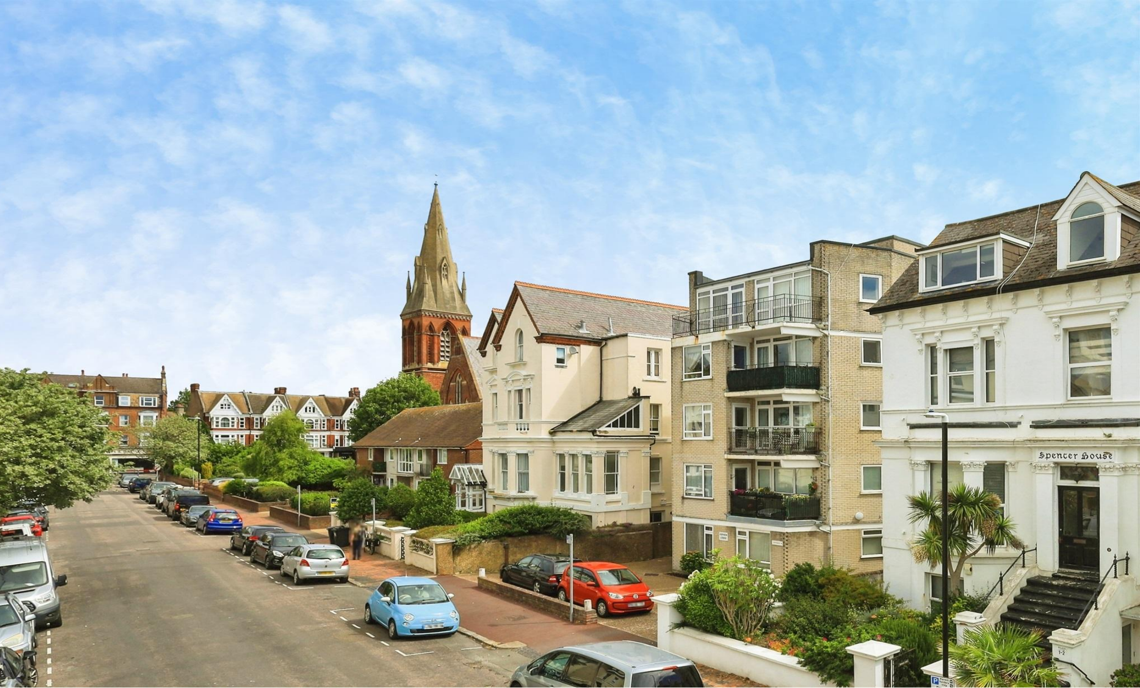
Vernon Lodge Spencer Road, Eastbourne BN21 4PA