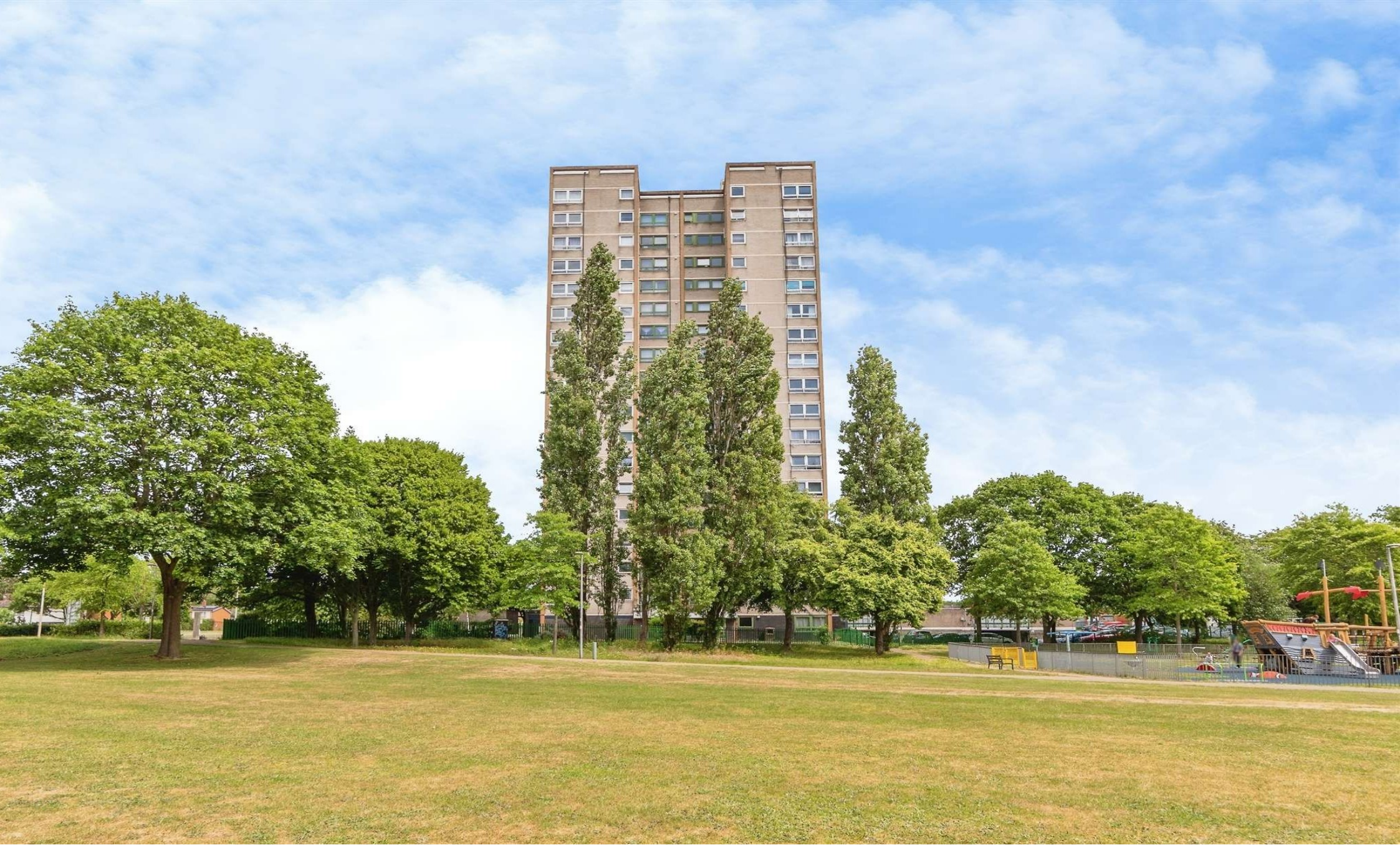
Harrow Court, Stevenage SG1 1JT