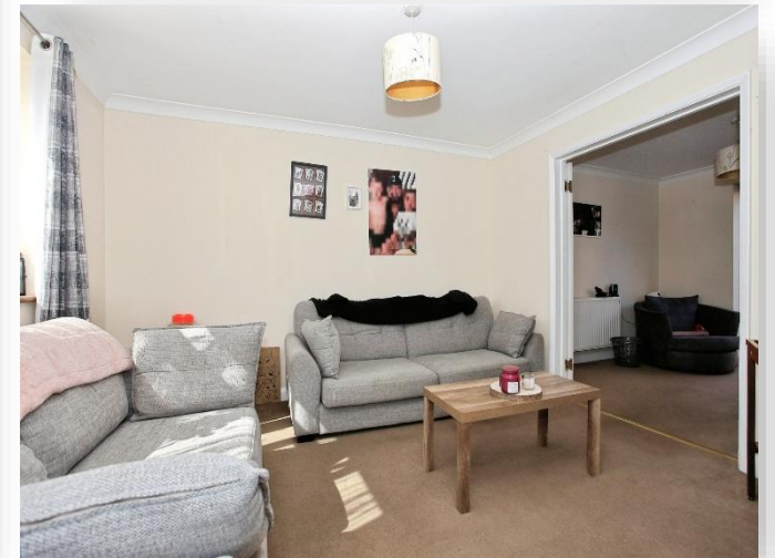
Crowland Road, Eye Peterborough PE6 7TR