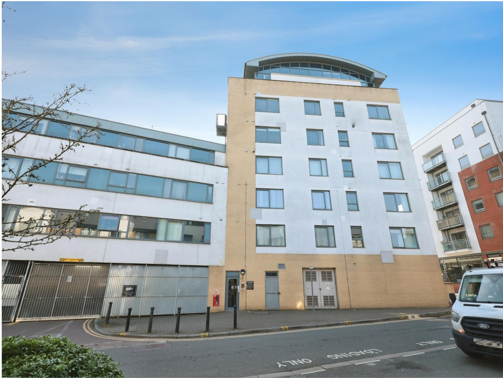
Queens Gate, Lord Street, Watford, WD17 2LQ