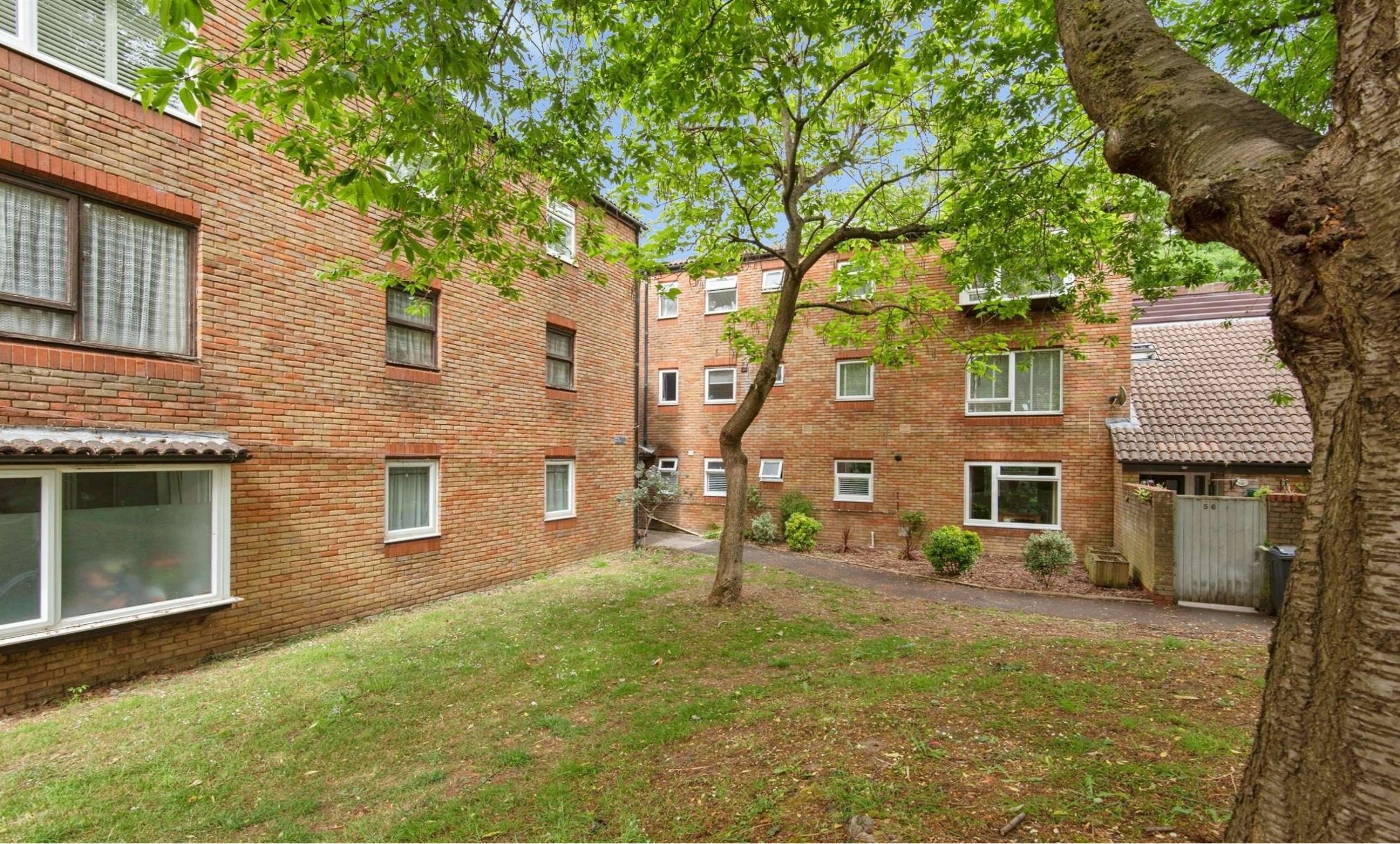
Baron Court, Stevenage SG1 4RS