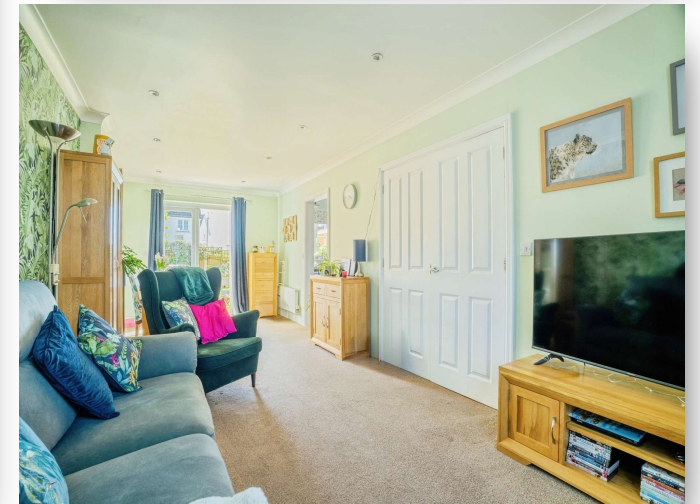
Goosander Road, Stowmarket, IP14 5BD