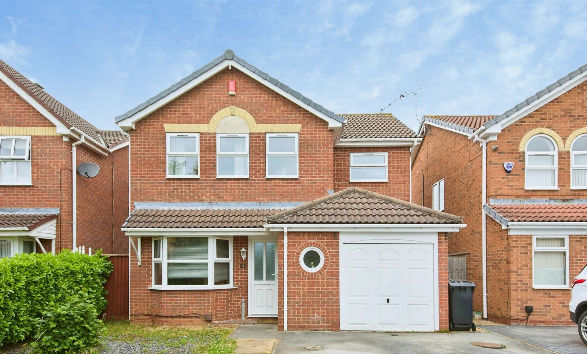
Mill Hill, Boulton Moor Derby DE24 5AF