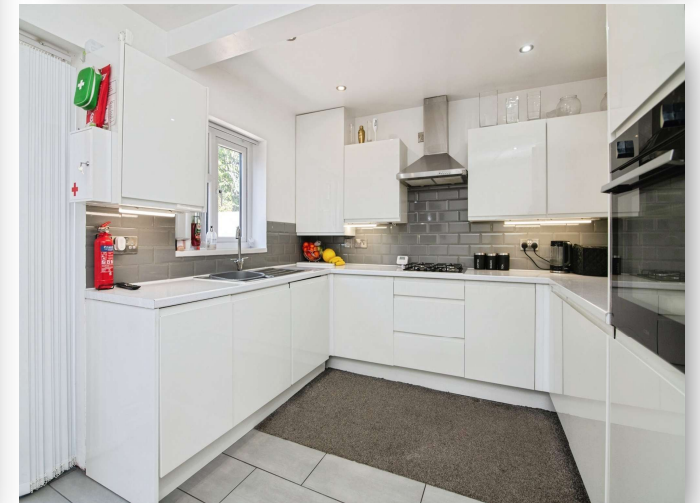
Edale Road, Birmingham B42 2DL