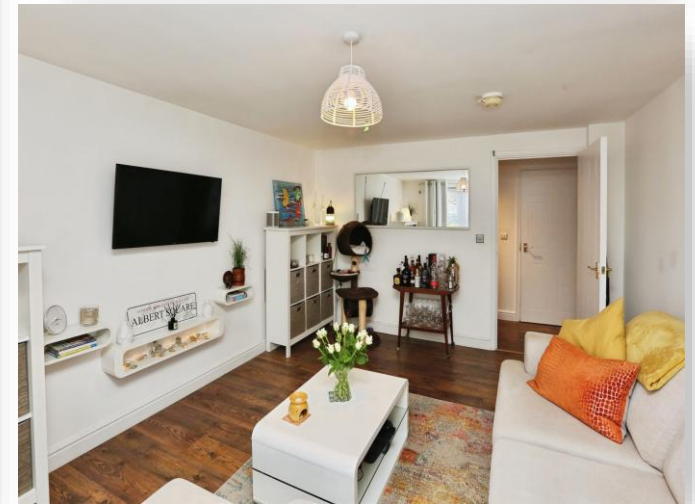
Fawn Crescent, Hedge End, Southampton, SO30 2QD