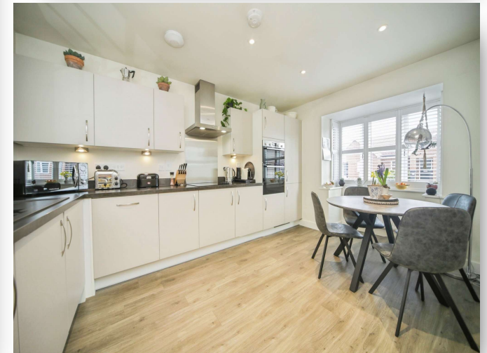
Cranesbill Way, Stowupland, Stowmarket, IP14 4FB