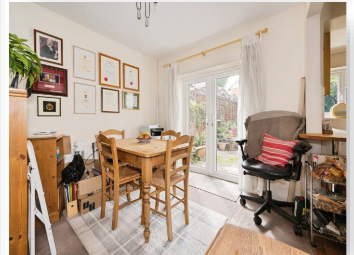
Northfield Road, Southampton SO18 2PS