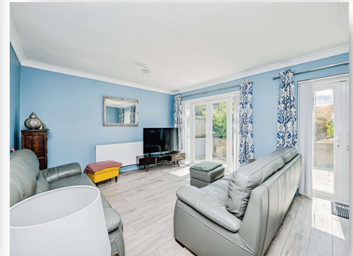
Ael-Y-Bryn, Llanedeyrn Cardiff CF23 9LH