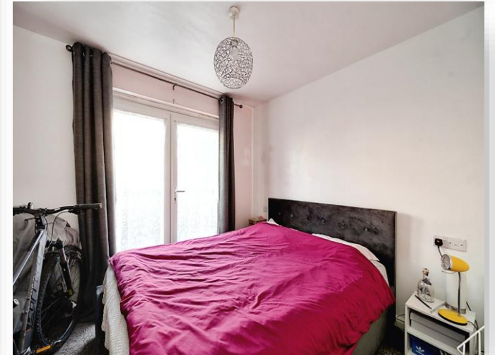
Little Hackets, Havant PO9 5AU