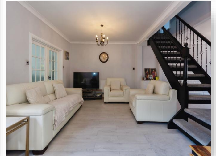
Vicarage Road, Halesowen B62 8HU