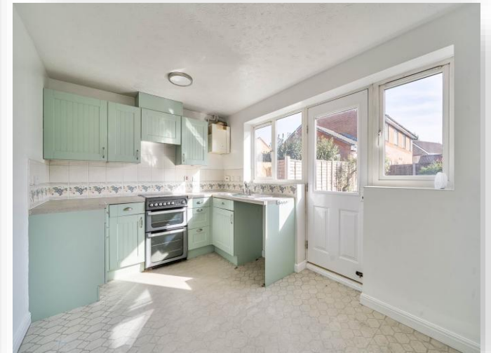
Old Masters Close, Walsall WS1 2QP