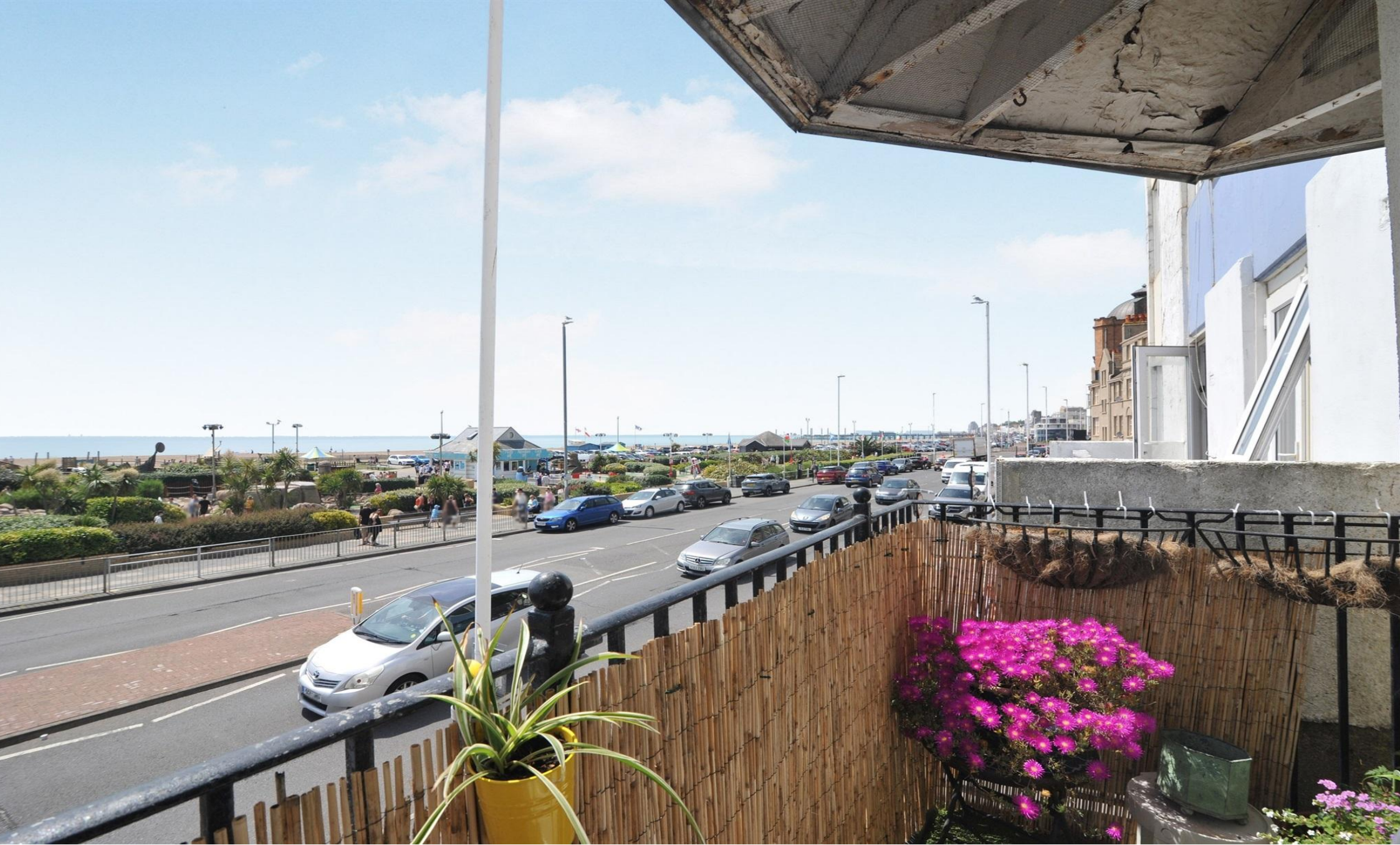
The Sea House - George Street, Hastings TN34 3EA